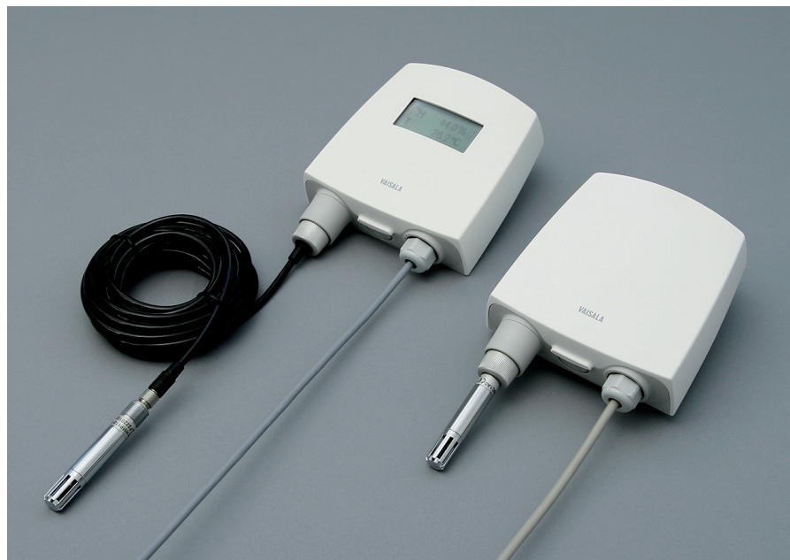
The HMT120/130 with and without a display.

The Vaisala HUMICAP® Humidity and Temperature Transmitters HMT120 and HMT130 are designed for humidity and temperature monitoring in cleanrooms and are also suitable for demanding HVAC applications.